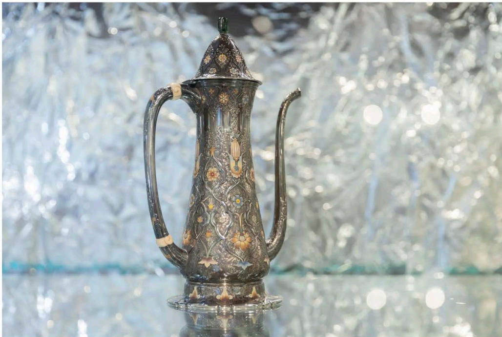
Silver and enamel coffee pot by Tiffany & Co. (1893), S.J. Shrubsole gallery.

2-3. English sculptor Henry Moore's insect-like bronze " Working Model for Thin Reclining Figure " ( Bowman Sculpture, 5-08 ) seems to be lying in every direction at once, with legs horizontal, upper body vertical, and a protruding rectangular belly button. Behind it, also in bronze, is a family of what look like enormous paper dolls come to solid, sensuous life, with elegant faces traced into their flat heads, by the Russian artist/sculptor Ossip Zadkine (1888–1967).